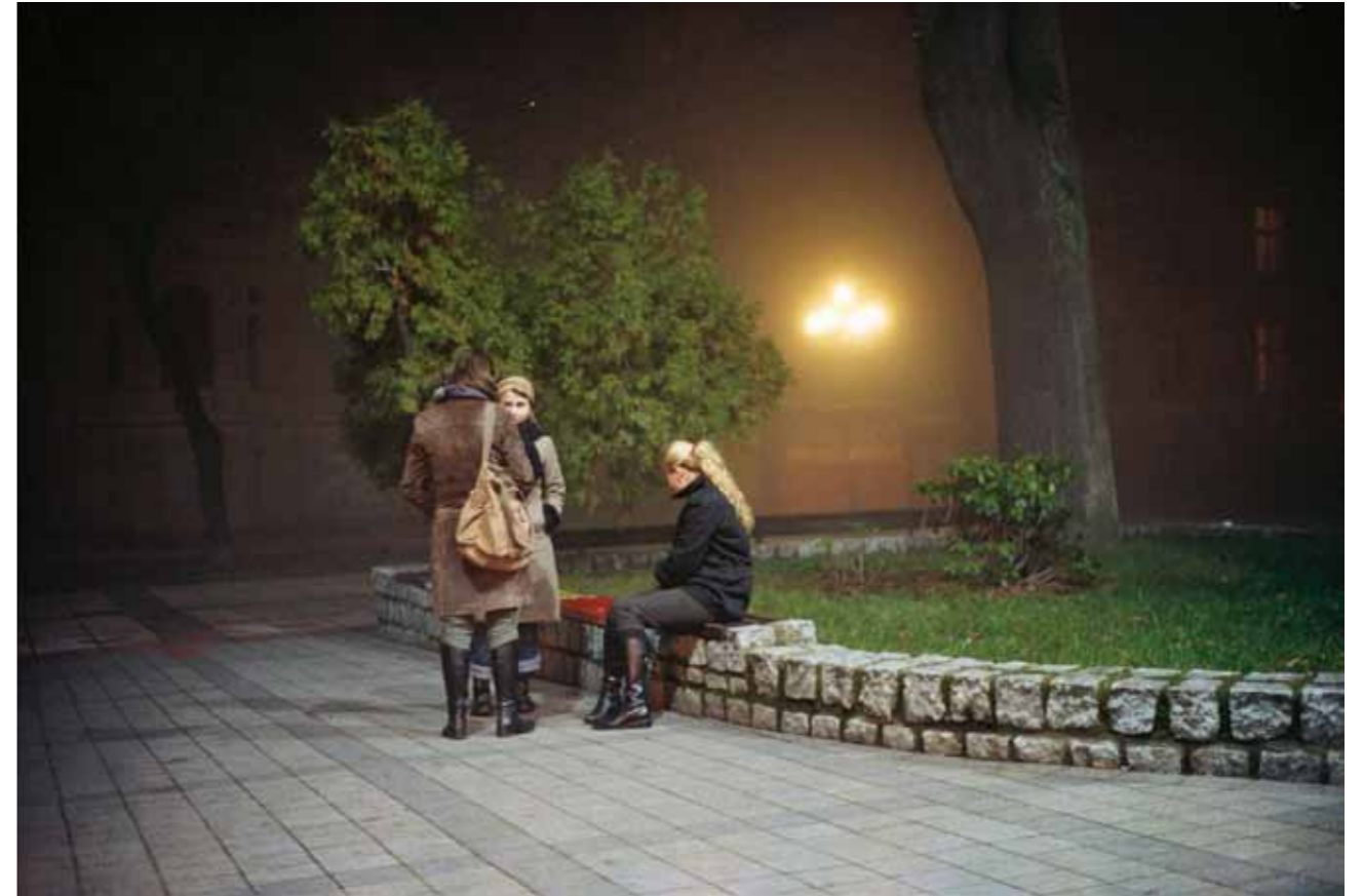
Tobias Zielony Zgora, 2008