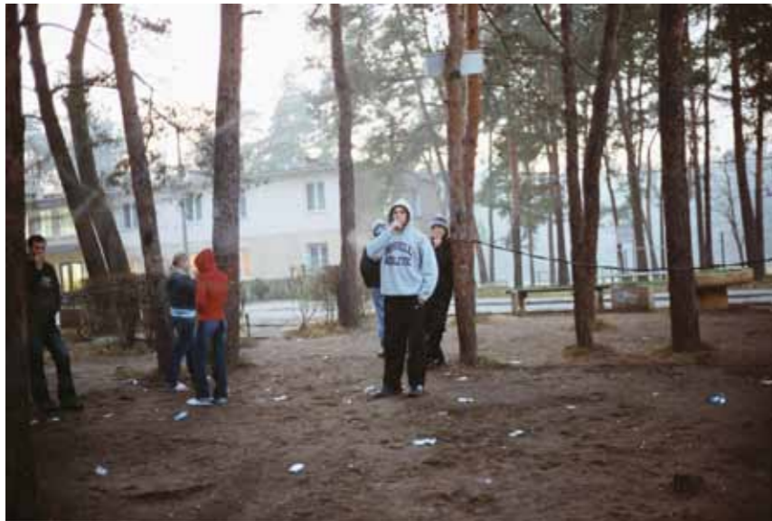
Tobias Zielony Zgora, 2008