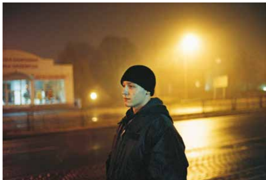
Tobias Zielony Zgora, 2008