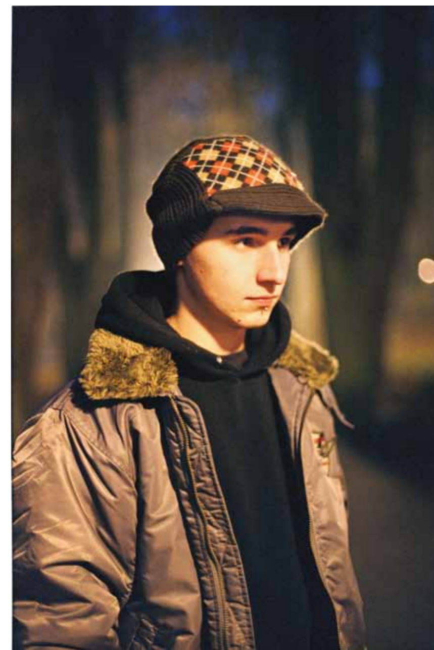
Tobias Zielony Zgora, 2008