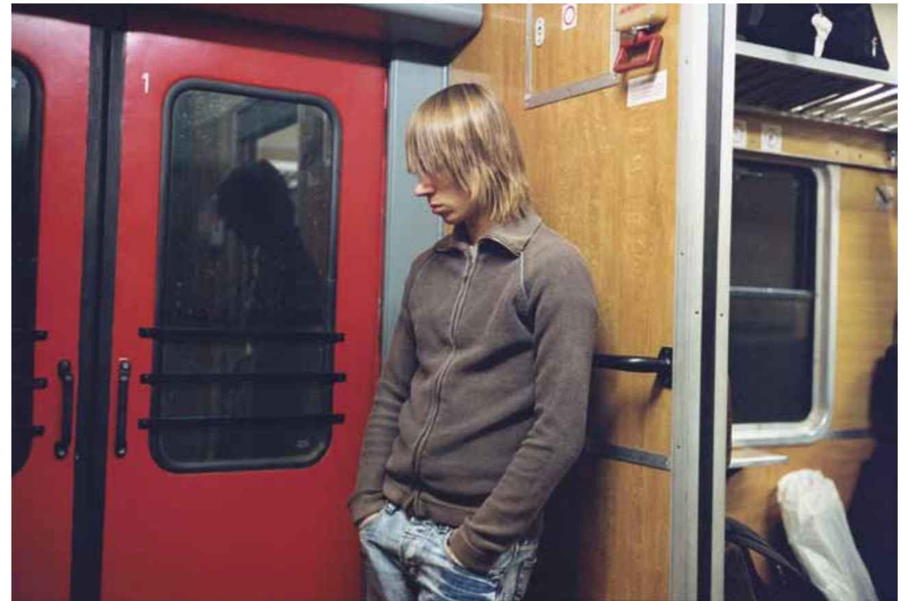
Tobias Zielony Zgora, 2008