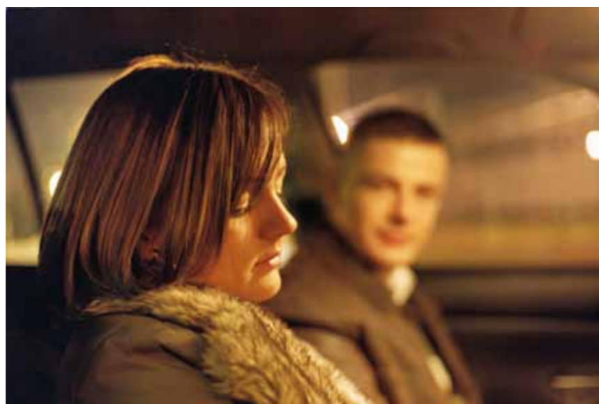
Tobias Zielony Zgora, 2008