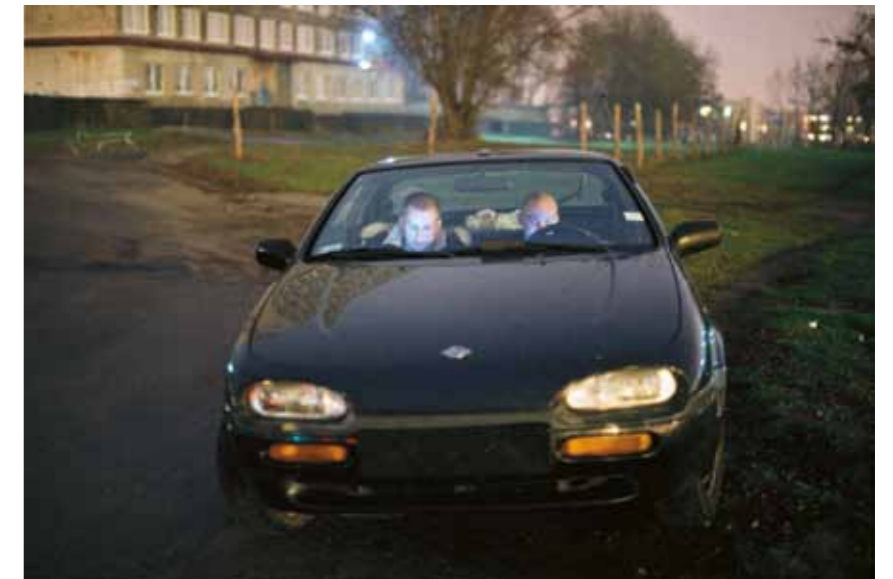
Tobias Zielony Zgora, 2008