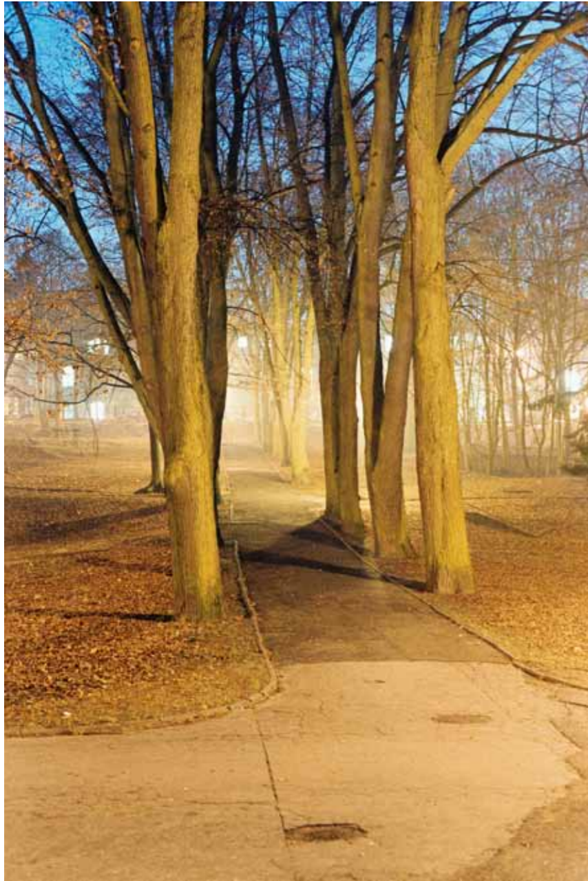
Tobias Zielony Zgora, 2008