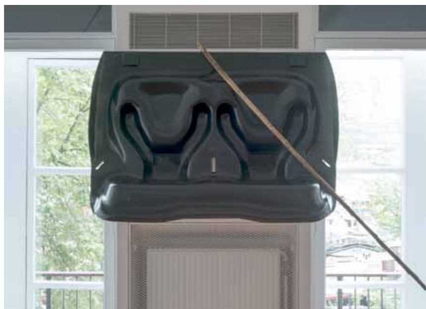
Michael E. Smith

Untitled, 2015 Police car backseat, sunflower stalk 141 x 105,5 x 29 cm