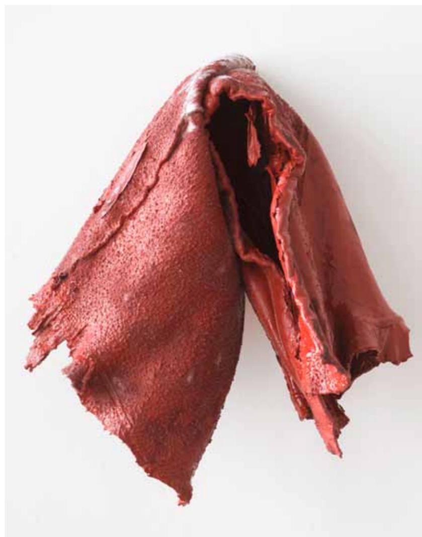
Michael E. Smith

Untitled, 2015 Police car backseat, sunflower stalk 141 x 105,5 x 29 cm