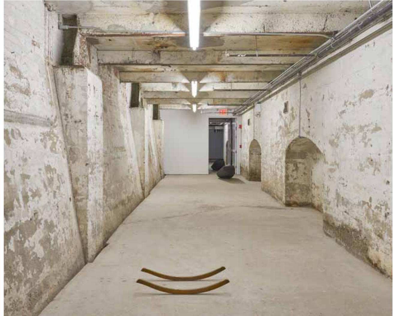
Michael E. Smith

Untitled, 2015 Two-channel SD video installation, 16:9, color, sound, 2:28 min.loop